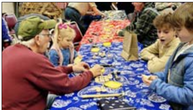
Boyd helping while other kids wait their turn.