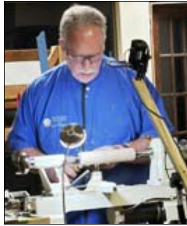
Demonstrating turning procedures.