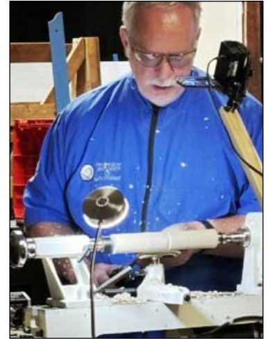
Turning a cove.

woods to use. He described soft woods, such as pine, as not suitable for good results as the wood splinters and tears more than being cut. He said maple is a very good wood to start with along with several other hardwoods. A lathe speed of 6,000 to 9,000 RPM is good to begin spindle turning. Dave stated that he follows the A, B, C's for turning: A nchor the tool on the tool rest; ride the B evel; raise the handle to C ut. Cut downhill as the tool is moved across the wood. Dave said that practice always makes you a better turner. He advised to get some wood and try turning beads, coves, and vees until feeling comfortable with the tools. Spindle turning can be very creative and still be simple to do. Dave provided a very complete presentation encouraging us to try something new. Thanks for giving us lots to think about.