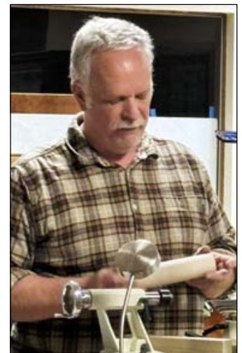
Describing the type of wood to turn.