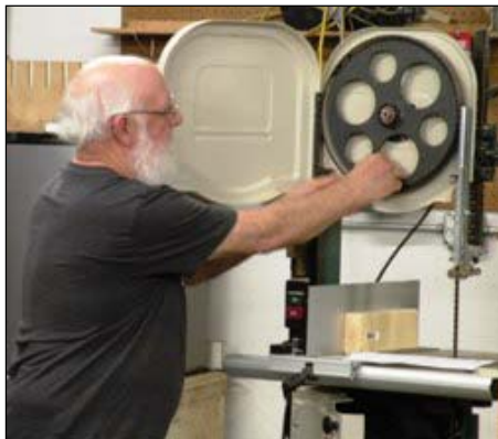
Explaining basic maintenance.