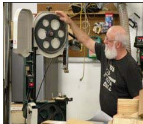
Showing the bandsaw tire.