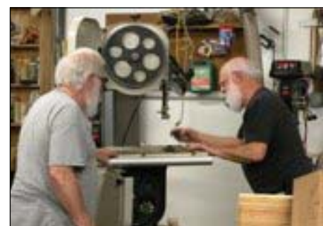
Putting the table back on to finish the adjustments.