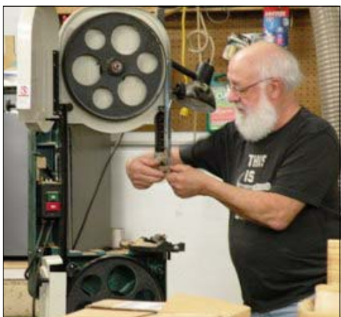
Adjusting the blade guides.