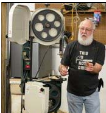
Showing what improperly adjusted guides will do in the cut.