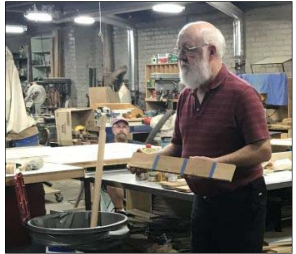
Showing how sanding affects stain saturation.