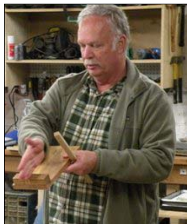
Talking about the bench hook.