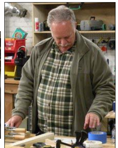
Speaking about using blue painters tape.

of wood. He showed different ways of using different clamps and how to “stretch” the clamps using a piece of wood if the clamps are not long enough. He demonstrated several uses of hand clamps to hold both round and flat objects and the secret to opening and closing them easily. Dave illustrated one way to secure beveled cut corners whether they were on a box or a picture frame. And he talked about several uses of painters tape in clamping unusually shaped objects or smaller objects