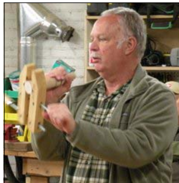
Clamping a round object with hand clamps.

of wood. He showed different ways of using different clamps and how to “stretch” the clamps using a piece of wood if the clamps are not long enough. He demonstrated several uses of hand clamps to hold both round and flat objects and the secret to opening and closing them easily. Dave illustrated one way to secure beveled cut corners whether they were on a box or a picture frame. And he talked about several uses of painters tape in clamping unusually shaped objects or smaller objects