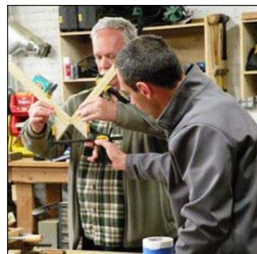
Showing one way to clamp a bevel joint.