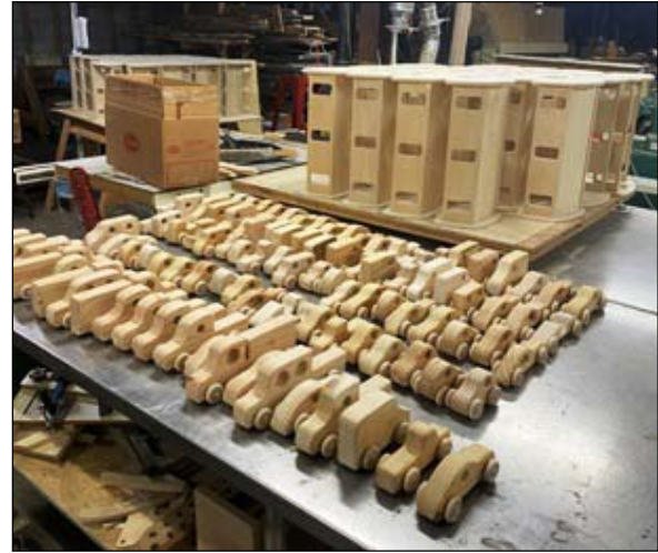
Doll cribs and toy cars and trucks ready for delivery.