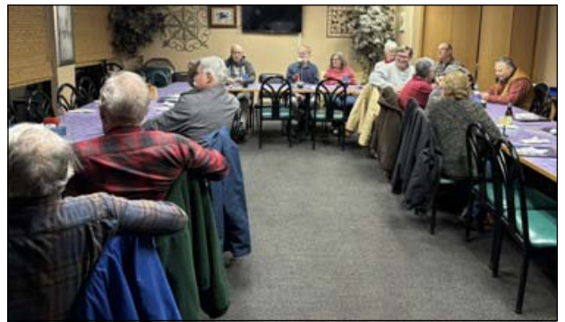
Ready to order.