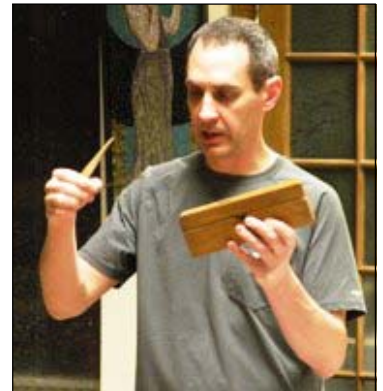
Giving some pointers on a wood body plane.