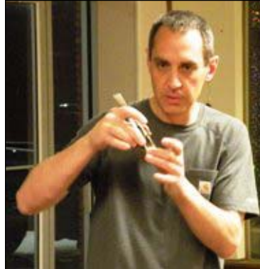
Explaining the level cap use.