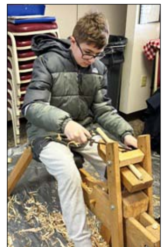
Making a round stick on the shaving horse.