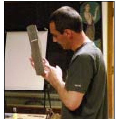
Tightening up the tote (handle).

faces. Inspecting the parts after cleaning for damage before beginning he flattening and sharpening is next. He showed how to flatten the frog mounting areas, the cap iron, and the back of the plane iron on a large piece of granite. He stressed that areas must be flat to be square before sharpening can be effective. He went on to tell how to sharpen the plane iron with a major bevel and a micro bevel and why both are needed to plane effectively. He mentioned that a lot of complaints that planes do not work well can be traced back to not having a sharp iron. He reassembled the plane and spoke about flattening the plane sole and the importance of having the plane completely assembled before doing this. Brian said after flattening, the plane was about ready to use. Inspecting the sole and sides for sharp edges and filing those off should be done before using the plane. Brian answered questions about the differences in bevel-up and bevel-down planes and why some plane soles have ridges called corrugations. He