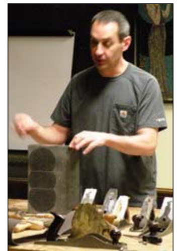
Describing the flattening stone.