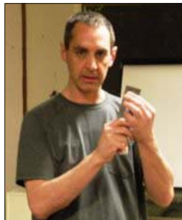
Explaining cap iron and plane iron relationship.