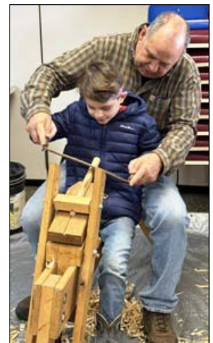
Helping a little girl on the shaving horse.