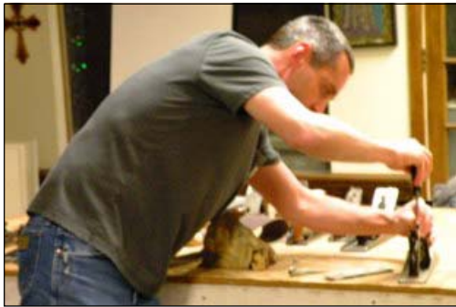
Disassembling the plane to restore.