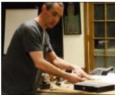
Polishing the back of the blade.

faces. Inspecting the parts after cleaning for damage before beginning he flattening and sharpening is next. He showed how to flatten the frog mounting areas, the cap iron, and the back of the plane iron on a large piece of granite. He stressed that areas must be flat to be square before sharpening can be effective. He went on to tell how to sharpen the plane iron with a major bevel and a micro bevel and why both are needed to plane effectively. He mentioned that a lot of complaints that planes do not work well can be traced back to not having a sharp iron. He reassembled the plane and spoke about flattening the plane sole and the importance of having the plane completely assembled before doing this. Brian said after flattening, the plane was about ready to use. Inspecting the sole and sides for sharp edges and filing those off should be done before using the plane. Brian answered questions about the differences in bevel-up and bevel-down planes and why some plane soles have ridges called corrugations. He