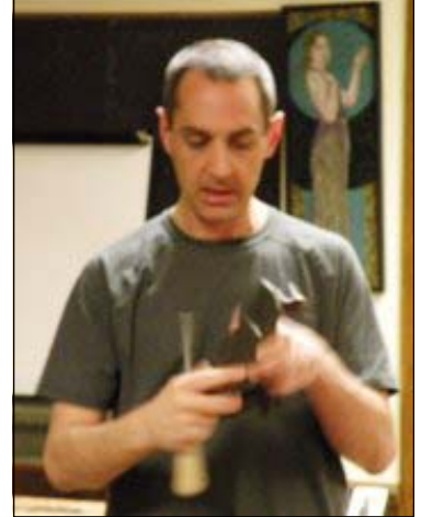
Showing how to reassemble.