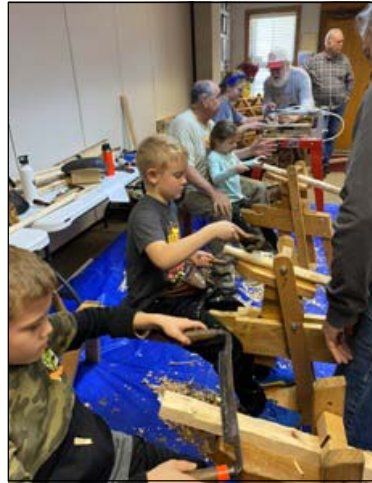
Kids working on the shave horses and the scroll saw.