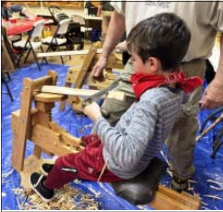
A young man working hard with the draw knife.

The Guild participated in the Pony Express Museum Family Day on Presidents Day, February 16. The Museum invites the community to come and see the Museum for free and also participate with a number of activities like a biscuits and gravy breakfast, sewing quilt pieces, making candles from deer tallow, and the Guild members helping kids learn about shave Horses and the scroll saw. We stayed busy with kids from 10 AM to after 1 PM when we were scheduled to leave. The Guild volunteers were busy helping kids use drawknives to round wood pieces from square to round. Many of the kids seemed to want to make a spear-like object at the completion. They were also able to cut out animal shapes using the scroll saw. The kids were quite interested in learning about the tools and making projects. A big thanks to volunteers Lynn Anderson, Ralph Alvarez, Pete Peterson, Rusty Cook, Jim Jones, Tom and Jan Engel, Dave Halter, and Roger Martin for spending some time making kids happy.