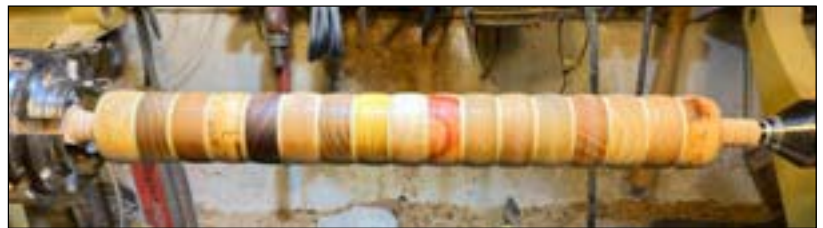
The 17 segments of the mace in the process of being turned.

Lynn reported the mace project for North Central Missouri College is in process. Ken Gerber, Kevin Crawford and others are working to have the mace ready for a meeting with the faculty members and students on March 27. The mace will have 17 different species of wood representing the 17 counties the College serves in northwest Missouri. The 17 species are cut in 3" x 3" squares with a piece of holly wood separating the squares.