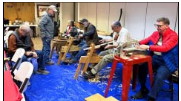
Volunteers warming up before the kids come in.