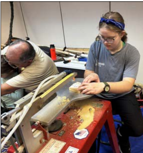
A young lady working on the scroll saw.