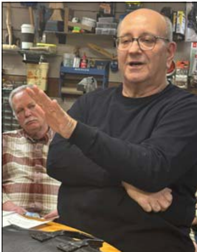
Talking about cabinet making.